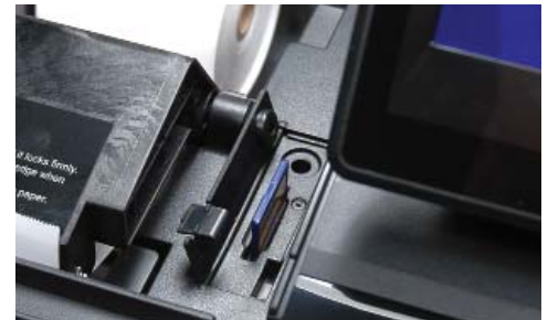
SD Port Hidden Under the Printer Cover is Secure from Tampering