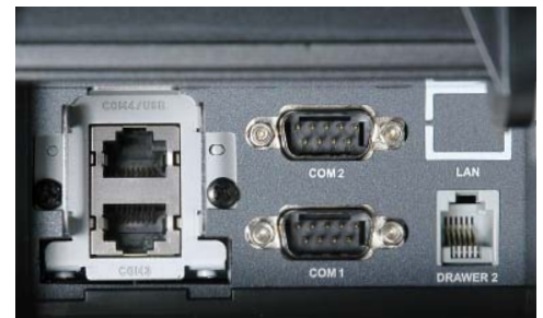
Up to 4 RS-232C Ports Hidden Behind a Convenient, Easy to Access Door