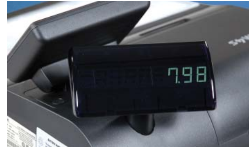
9-Digit LED Customer Turret Display