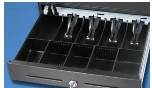
2 Media Slot Drawer with Extra Deep Insert and Adjustable Coin Dividers