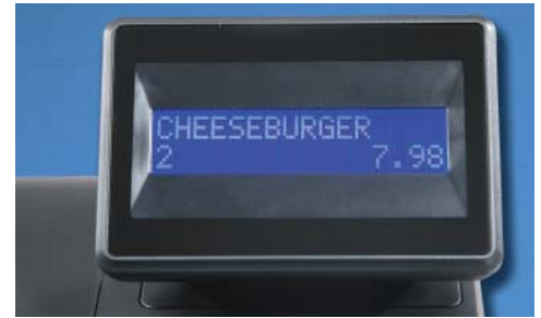
Two-Line by 16-Character LCD Operator Screen