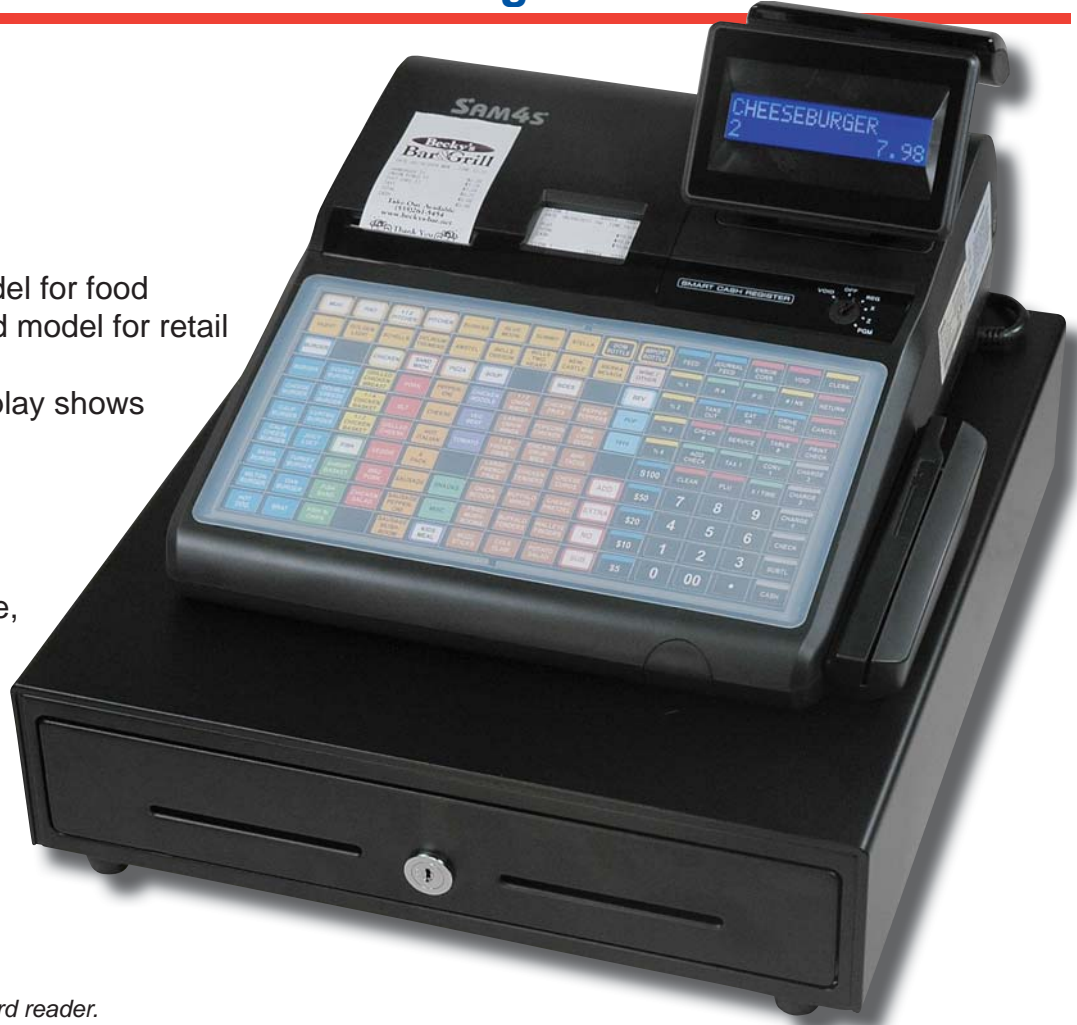
SAM4s ER-940 shown with optional card reader.